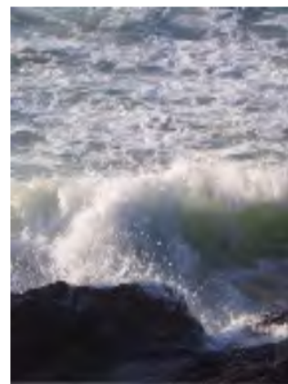
An ocean wave is an example of how energy moves through water.

The constant flow of charged particles is an electric current. Negatively charged particles move toward positively charged particles. Electric current needs an unbroken path, or circuit. A circuit is made of wires, an energy source and something that requires energy. Then the current can flow!